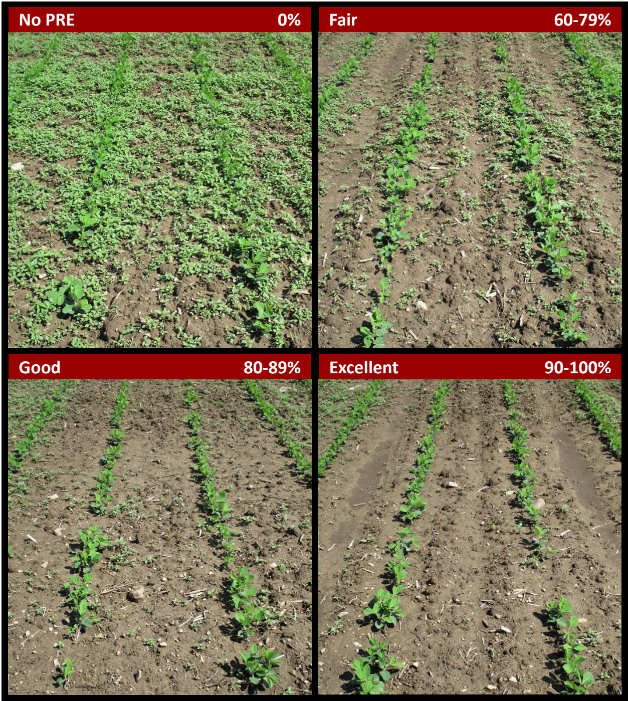
Figure 3. Plot photos indicating categories of PRE herbicide waterhemp efficacy.